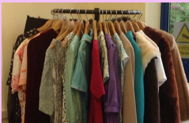
Urban Vintage at The Maples