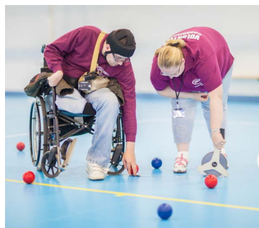
Sport taster sessions at LD Week 2013