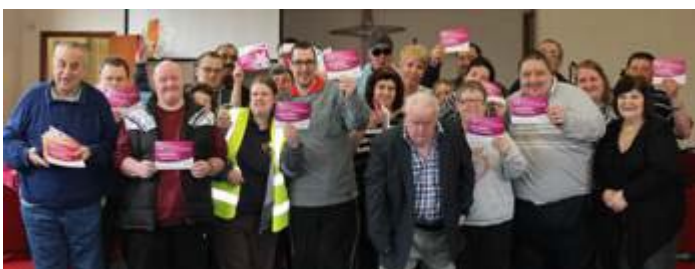
ELF participants in the weight loss programme

ELF stands for 'Eat well, Live an active life, Feel sustainable lifestyle changes, including helping service users to access screening and health care services, choose and prepare healthy food and helping them to become more active. Highlights so far have included cookery demonstrations, local nature walks, dance aerobic sessions and a bespoke weight loss programme.