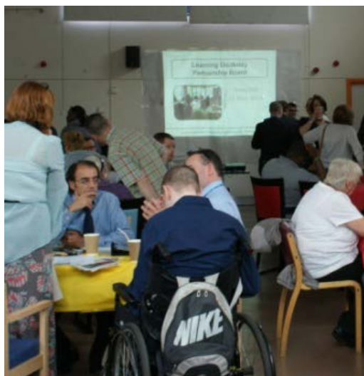
Participants at the LDPB Away Day 2013